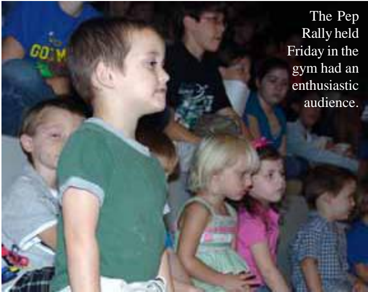
The Pep Rally held Friday in the gym had an enthusiastic audience.