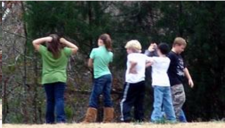
The playground is a great place for the elementary students to release stress. At REBUL one may see the high school students playing the games with the younger students. These elementary students learn early how to create games with what they have available.